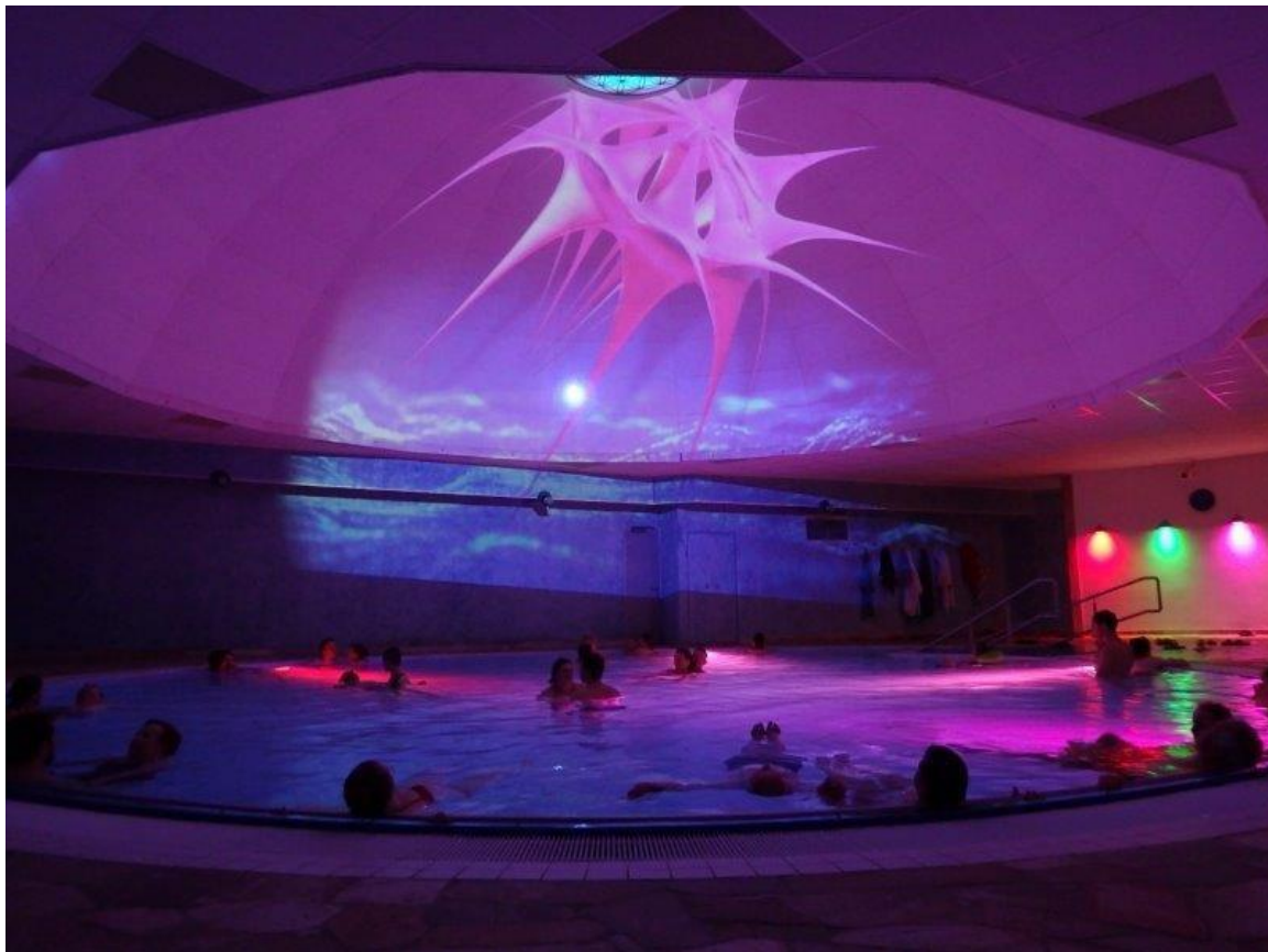
Liquid Sound Festival

Would you prefer to skip the drive home after the festival and instead relax in a comfortable bed? Then book your overnight stay at the Hotel Elbresidenz an der Therme Bad Schandau , located just 200 meters away. Admission to the thermal baths is included for hotel guests.