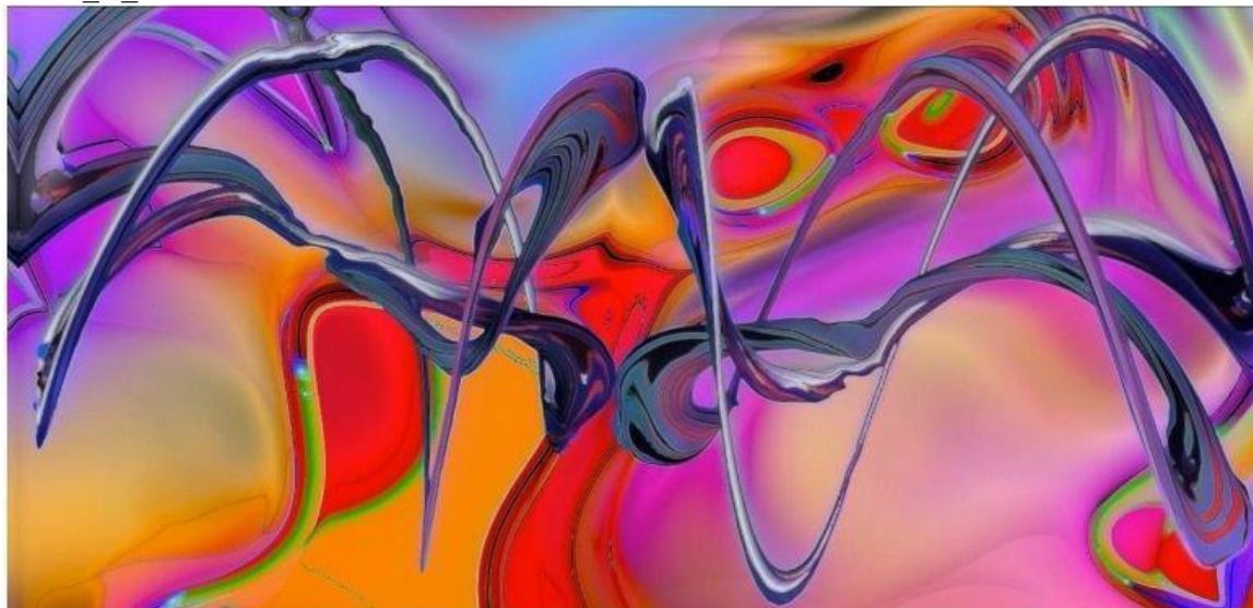
FLUID_M_LS Jo Siamon Salich