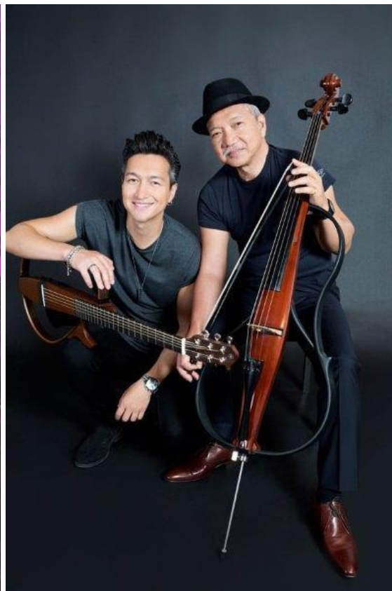
Thet à Thet