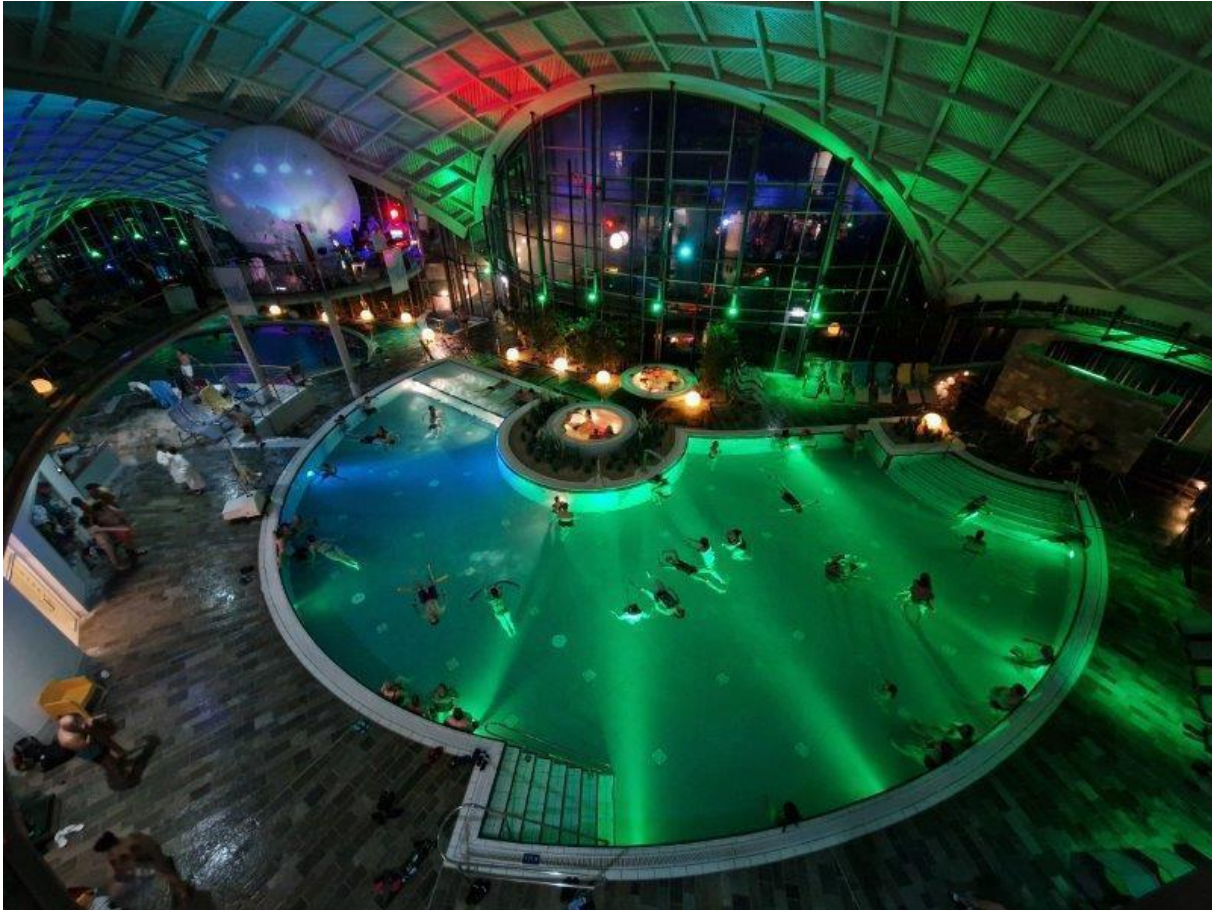
Liquid Sound Festival